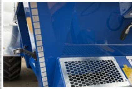
Front Reflective Tape