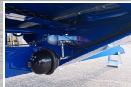
NC Cable Break Away System