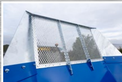
Front Muck Guard