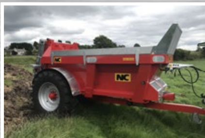
Galvanised Extension Sides