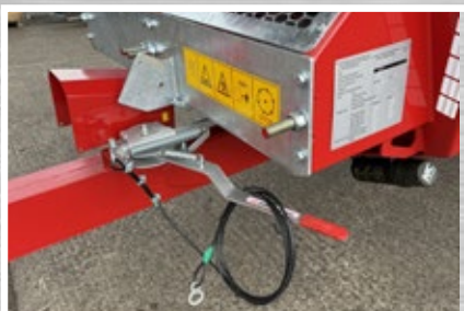
Powerbrake – Handbrake & Break Away System