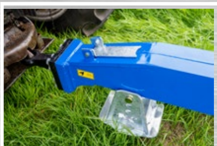
Drawbar boot, PTO shaft stand, Bolt On 50mm Agri Towing Eye