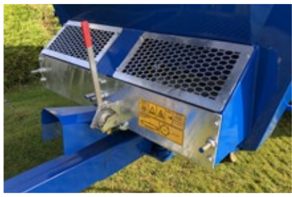
Ratchet Style Handbrake