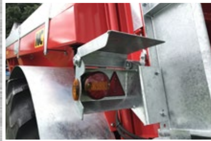
Automatic Light Covers