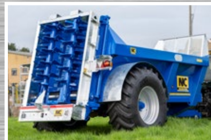
Reflective Tape on Side & Rear