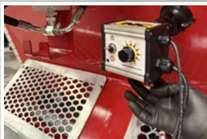
Floor Speed Control Valve – Electric Version c/w In Cab Controller