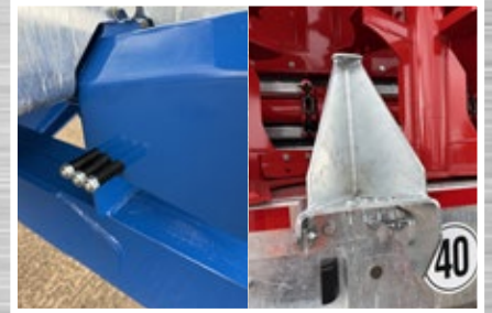
Spare Shear Bolts