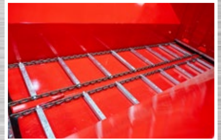
Floor Chains & Slats