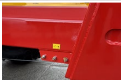
Remote Greasing for Shaft & Auger Bearings