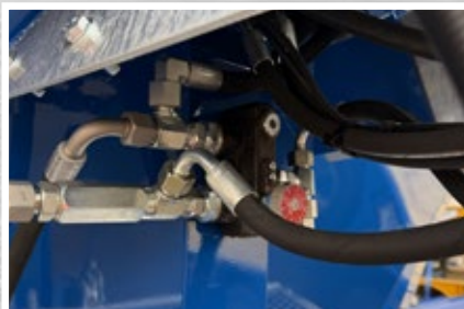
Floor Speed Control Valve