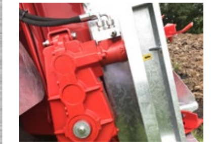
Floor Drive Gearbox c/w Pressure Relief Valve to Protect Chains