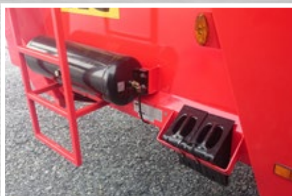
Air Brakes, Wheel Chocks