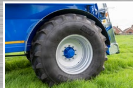
650/75R32 BKT Wheels on 11m3