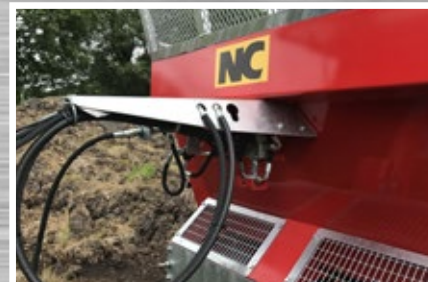
Hydraulic Hose Storage