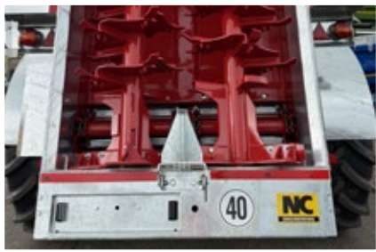
Vertical Rotors c/w Hardox Blades, Number Plate Holder