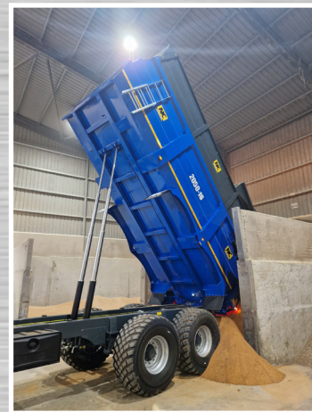
Twin Tipping Ram