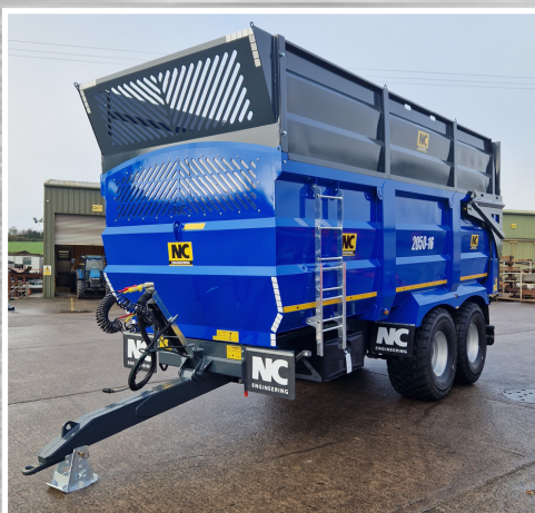
Perspex Window And Front Mud Flaps