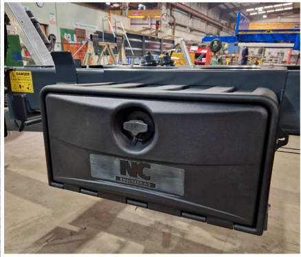
Plastic lockable toolbox