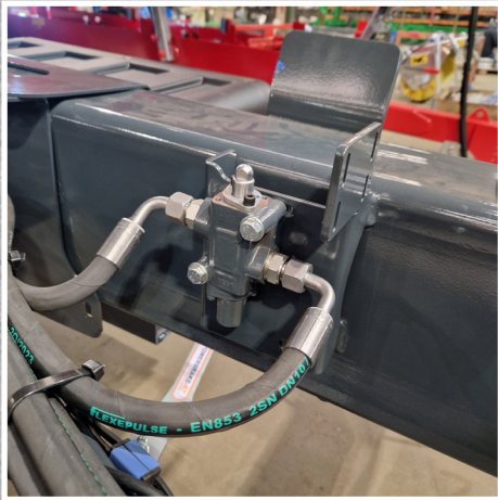
Hydraulic Tipping Safety Switch