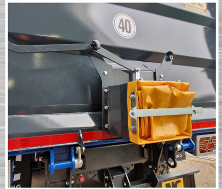
Grain Chute Extension with sock