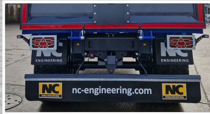
Full length rear mudflap