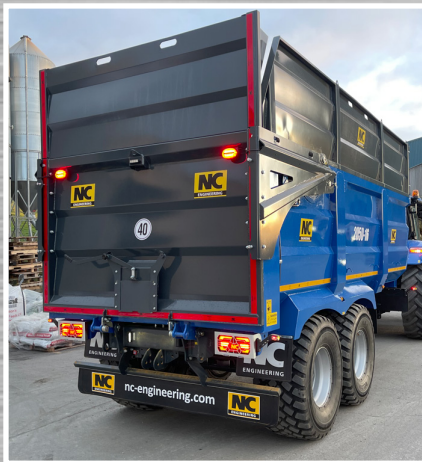
High and Low Level Rear LED lights