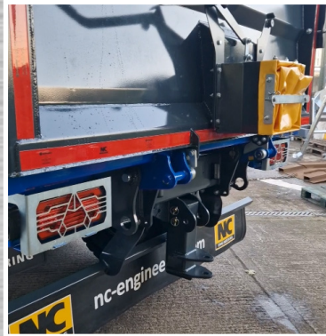
Foldable rear tow hitch